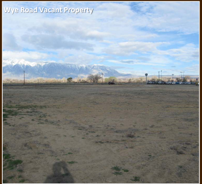
Wye Road Vacant Property

For current county contact information, please visit www.rdsbc.org/contact-us/